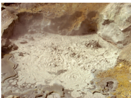
The vigor of Lassen’s hydrothermal features, such as this mudpot, varies seasonally. In spring, when cool ground water from snowmelt is abundant, fumaroles and pools have lower temperatures, and the mud in mudpots is more fluid.

The remarkable hydrothermal features in Lassen Volcanic National Park include roaring fumaroles (steam and volcanic-gas vents), thumping mudpots, boiling pools,