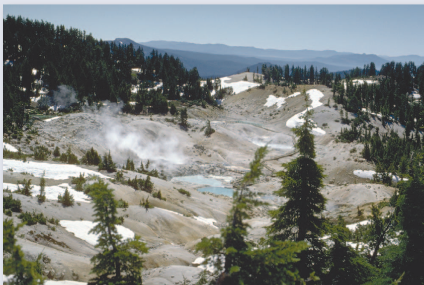
The hottest and most vigorous hydrothermal features in Lassen Volcanic National Park are at Bumpass Hell, which marks the principal area of upflow and steam discharge from the Lassen hydrothermal system. A prominent steam plume marks the site of Big Boiler, the largest fumarole (steam and volcanic-gas vent) in the park. The temperature of the high-velocity steam jetting from it has been measured as high as 322°F (161°C). Most of the hydrothermal features in the park contain mixtures of condensed steam and near-surface ground water and have temperatures that are near boiling. The steam-heated waters of the features are typically acidic and, even if cool enough, are not safe for bathing.

H ydrothermal (hot water) features at Lassen Volcanic National Park fascinate visitors to this region of northeastern California. Boiling mudpots, steaming ground, roaring fumaroles, and sulfurous gases are linked to active volcanism and are all reminders of the ongoing potential for eruptions in the Lassen area. Nowhere else in the Cascade Range of volcanoes can such an array of hydrothermal features be seen. Recent work by scientists with the U.S. Geological Survey (USGS), in cooperation with the National Park Service, is shedding new light on the inner workings of the Lassen hydrothermal system.